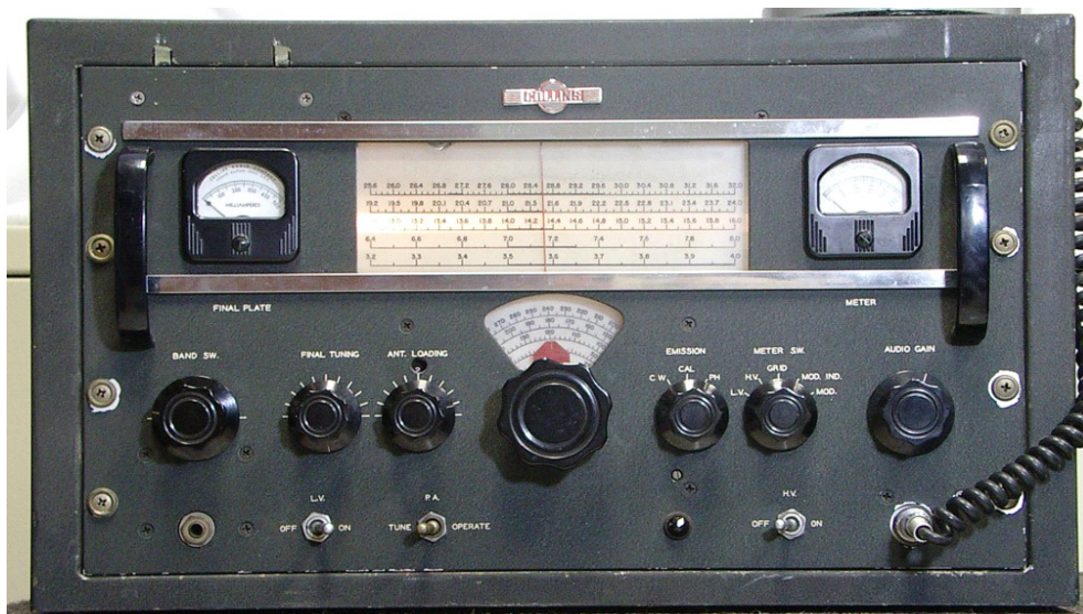
Illustration 6: Collins 32V-3 Transmitter.

This “beast” weighed in at over 110 pounds. AM plate modulated with a pair of 807s, the final was a RK4D32 for 120W input.