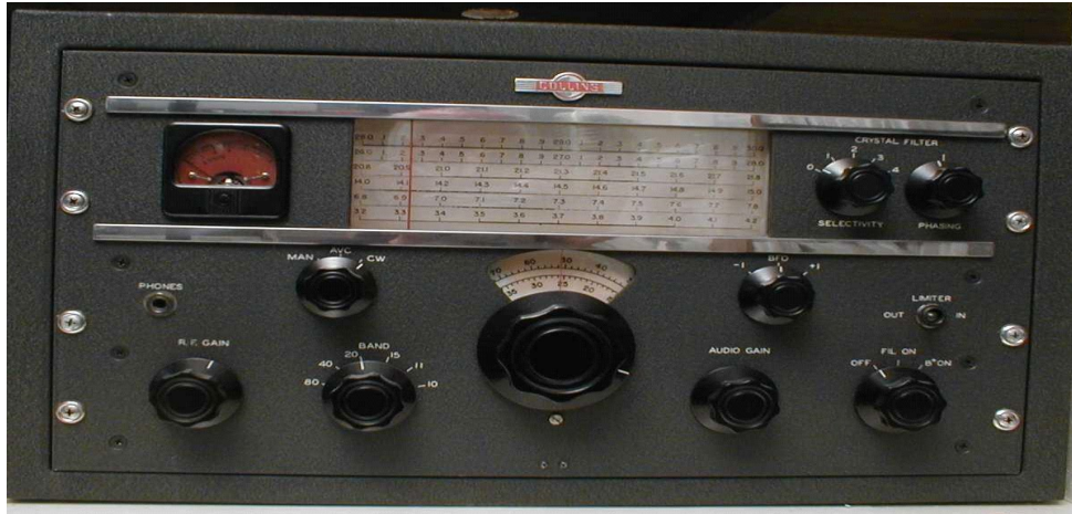
Illustration 4: Collins 75A-1 Receiver.