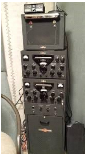
Illustration 7: Not your father's Collins! Unless he was rich! The Collins "Gold Dust Twins"

Collins marketed the AM/SSB/CW station in 1955 popularly known as "The Gold Dust Twins". The name probably reflects the 5 pounds or so of gold dust necessary to finance their purchase. In 1955, the 75A-4 RX cost $695.00, the KWS-1 TX $1435.00, for a total of $2130.00. In today's $$, only about $19,000!!!