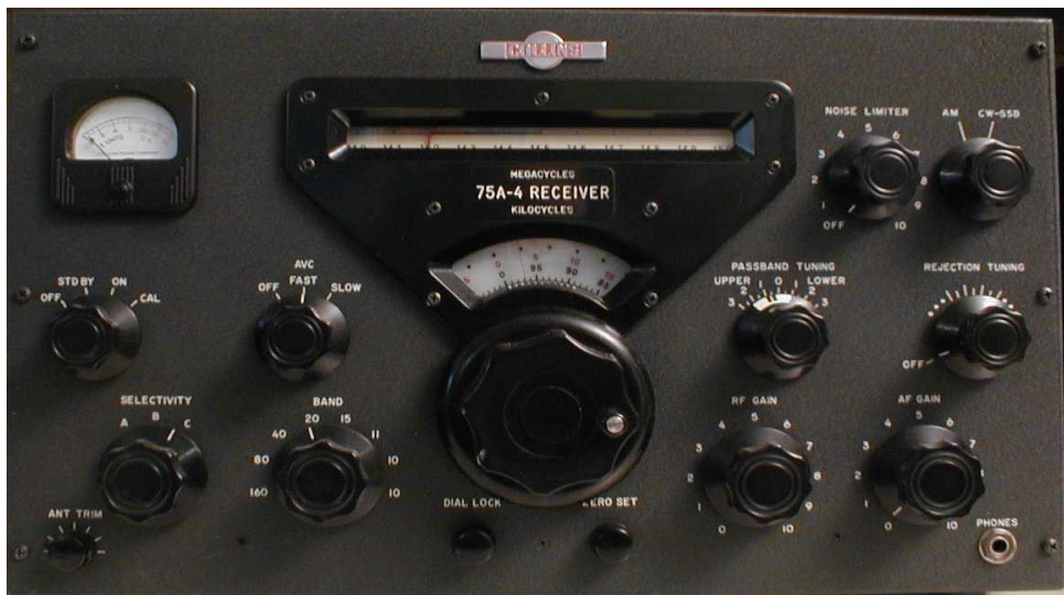
Illustration 5: Collins 75A-4 Receiver.

Matching transmitters were the 32V-1 thru 32V-3. A 32V-3 is pictured below.