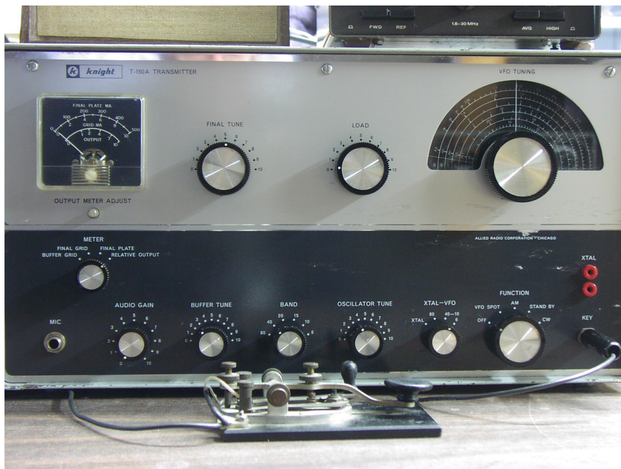
Barry's Classic Allied Radio Knight Kit T-150 AM/CW transmitter with J-38 key in foreground.