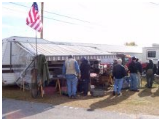
Above: The K1YTS / KB1KEF table