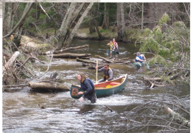
below: low water and snags forced several canoeists out of their crafts mid-stream.

The volunteers were treated to a spaghetti dinner along with the participants at the West Townsend VFW after the event.