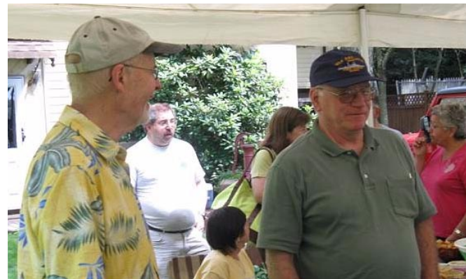
Above: WB1BYH, KD1YH, N1MGO Left: K1JHC, KB1JXJ, KB1LRL Below: W1HFN, N1QDZ