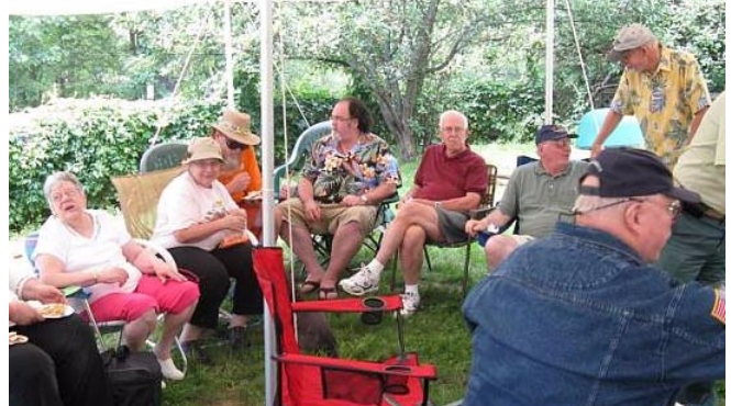
Above: Dot, KB1KEF, K1YTS, KK1X, K1JHC, N1MGO, WB1BYH, KB1OKF