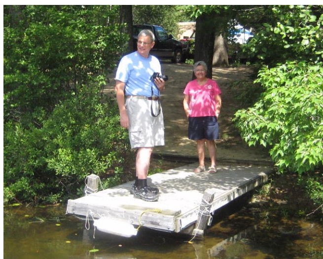
Above: KB1JZU and KB1JXJ watch a departing lake tour get underway.