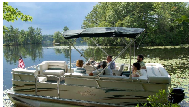
Below, left and right: Captain N1QDX leads two tours of Hickory Hills Lake before the rain starts.