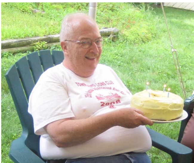
Above: KT1I celebrates a birthday too, with cake from KB1JXJ.