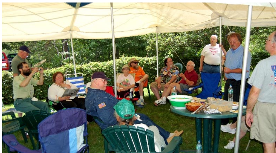
Left: N1MGO, KD1SM, Peg, KB1OKF, KB1KEF, K1YTS, KK1X, K1JHC, KT1I, KB1LRL, N1QDX