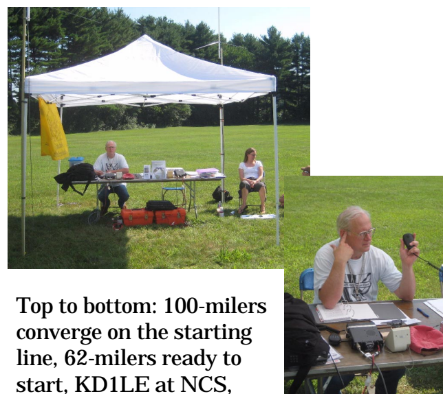
Top to bottom: 100-milers converge on the starting line, 62-milers ready to start, KD1LE at NCS, Net Control.